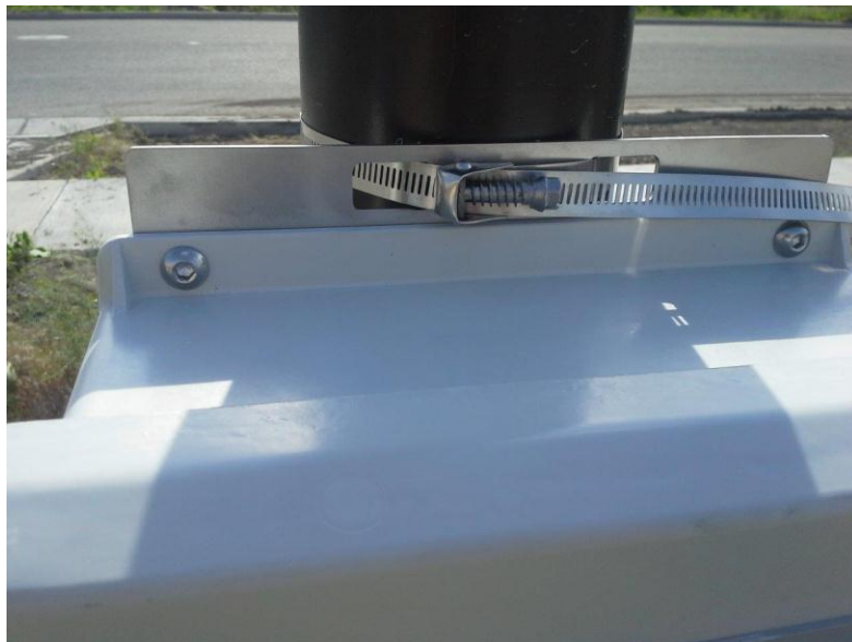
Figure 4 - Close Up of Metal Strapping