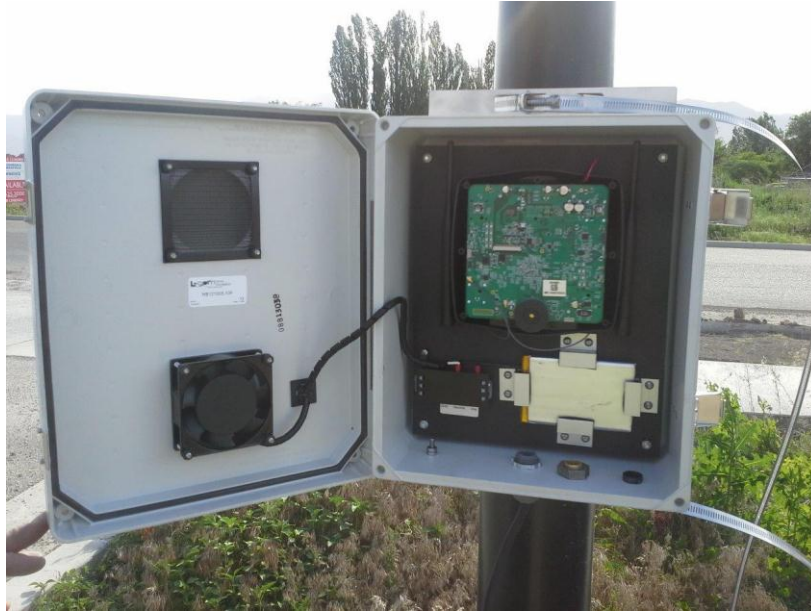
Figure 3 - Rad-DX NEMA Enclosure on Pole

The Rad-DX NEMA Enclosure is designed to be attached to a pole with metal strapping. See pictures below for example installation.