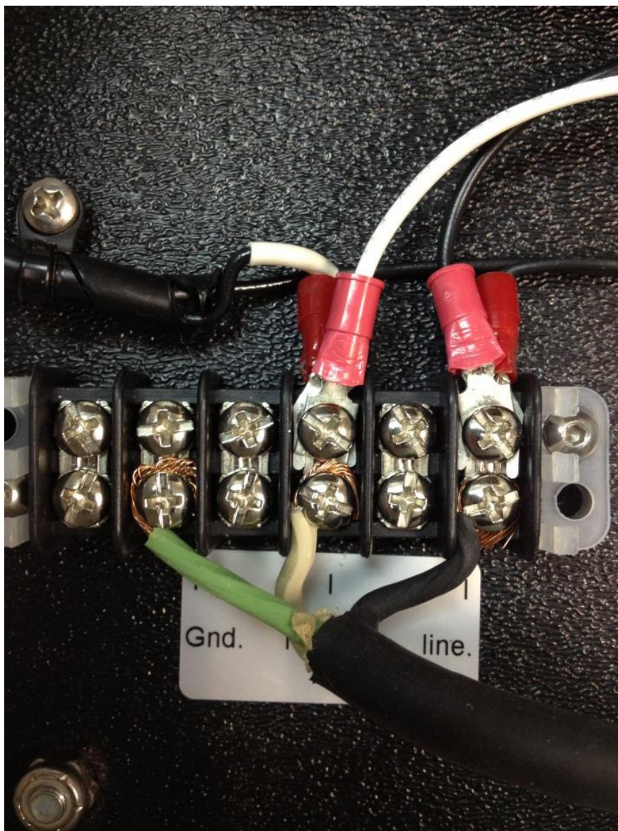
Figure 8 – 120V Wiring Connections

For 120V Installations: Follow accepted NEC guidelines with a green wire for ground, white wire for neutral and a black wire for the hot lead. Replace the wiring guard and close the NEMA Enclosure.