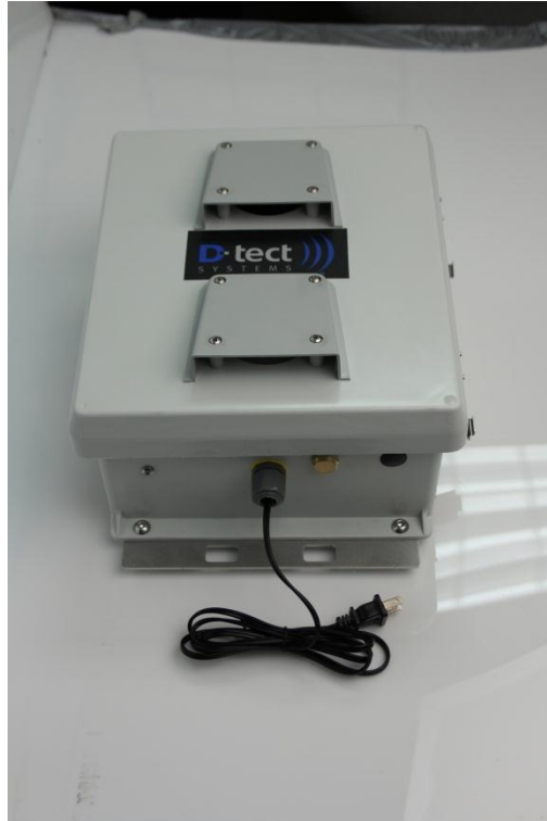
Figure 2 – Rad-DX NEMA Enclosure with Temporary Power Cable

The Rad-DX NEMA Enclosure ships with a temporary power cable which allows the user to easily configure and test the device.