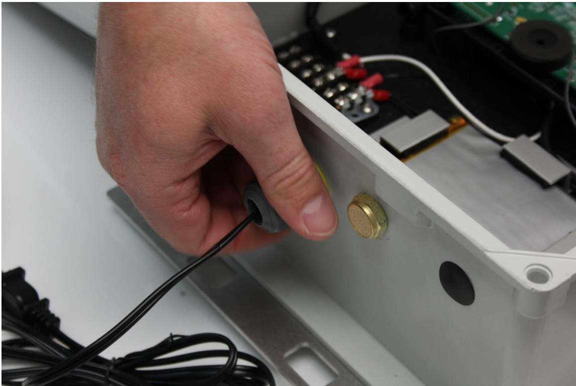
Figure 5 - Remove Retaining Nut