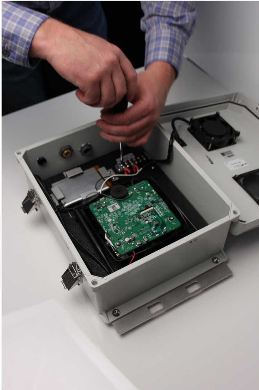
Figure 6 - Remove Power Cable

Remove the wiring guard and loosen the screws that connect the temporary power cable to the terminal block. Pull the temporary power cable out of the NEMA Enclosure and the retaining nut and strain relief.