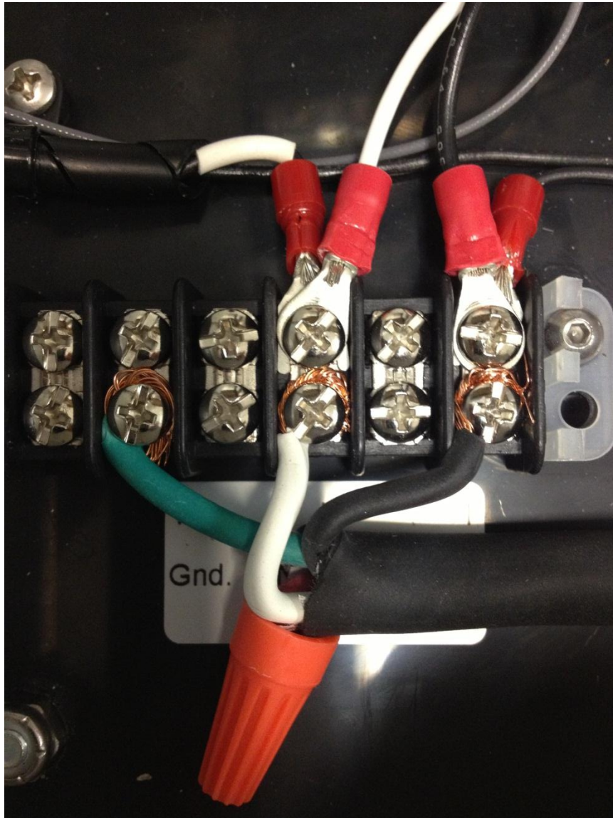
Figure 9 - 240V Wiring Connections

For 240V Installations: Follow accepted NEC guidelines with a green wire for ground, white wire for neutral and a black wire for the phase 1 hot lead. Place a wire nut on the red wire to cap the phase 2 hot lead. Replace the wiring guard and close the NEMA Enclosure.