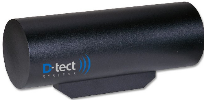
Figure 1. Each rad-D detector is 17.5" in length and 5" in diameter.

A rad-D system consists of one to four detectors (Figure 1), an Alarm Display Panel (Figure 2) and optional PRM Mounting Bracket (Figure 3). There are two types of detectors, a gamma detector and a neutron detector. The gamma detector detects gamma radiation and high-energy X-rays emitted from radioactive materials. Gamma detectors come in two varieties, a narrow-field of view detector and an omni-directional detector. The neutron detector detects neutrons emitted from a small number of very important radioactive materials. Any combination of one to four gamma and/or neutron detectors can be installed and monitored by a single Alarm Display Panel.