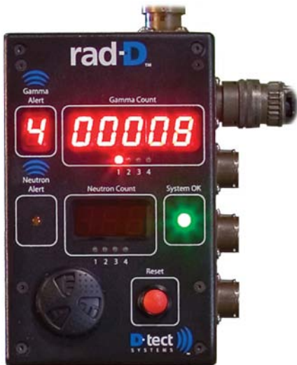
Figure 2. The Alarm Display Panel displays from up to 4 different detectors