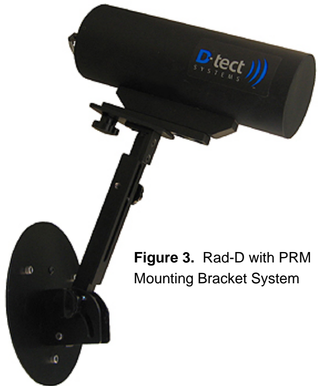
Figure 3. Rad-D with PRM Mounting Bracket System